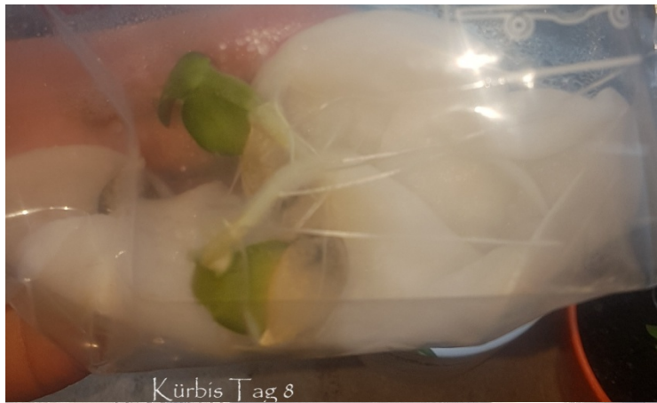
Kürbis Tag 8