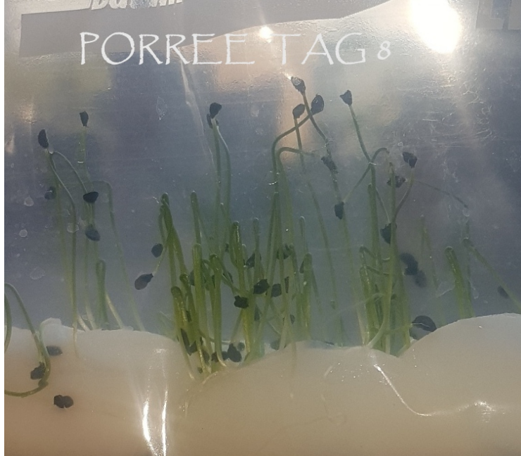
PORREE TAG 8